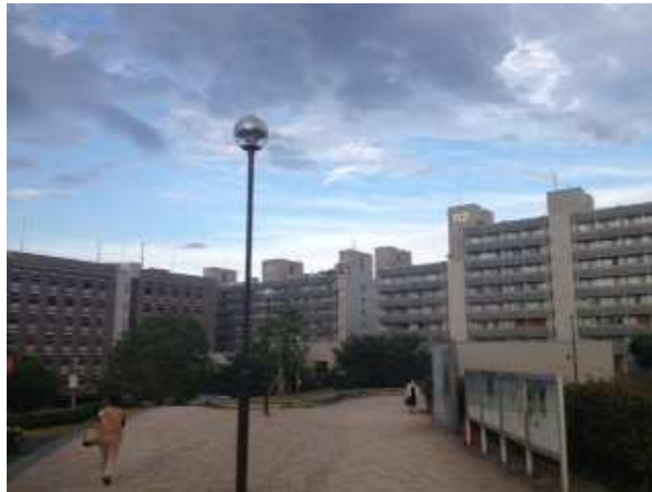
Fig. 2. The TITECH's Suzukakedai Campus

be able to take the advantage of being co-located with other Faculties in many inter-disciplinary and multi-disciplinary research and graduate programs.