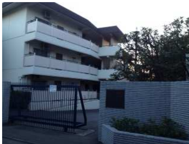
Fig. 1. The International House at the TITECH's Ookayama Campus

Having 3 (three) different campuses: the Tamachi campus, the Ookayama campus and the Suzukakedai campus, TITECH (nicknamed "Tokodai" in Japanese) could be taken as a good model for the Hasanuddin University Faculty of Engineering, whose campuses are also located in 3 (three) different places: the old Baraya campus, the current Tamalanrea campus and the new Gowa campus.