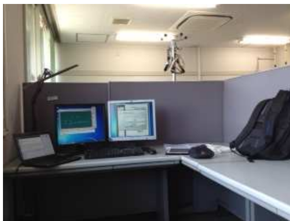
Fig. 3. My Work Station at the Process Systems Engineering Laboratory

especially the design, modelling and control of distillation columns. They are working on a special case of distillation columns called "Divided Wall Column" or DWC.