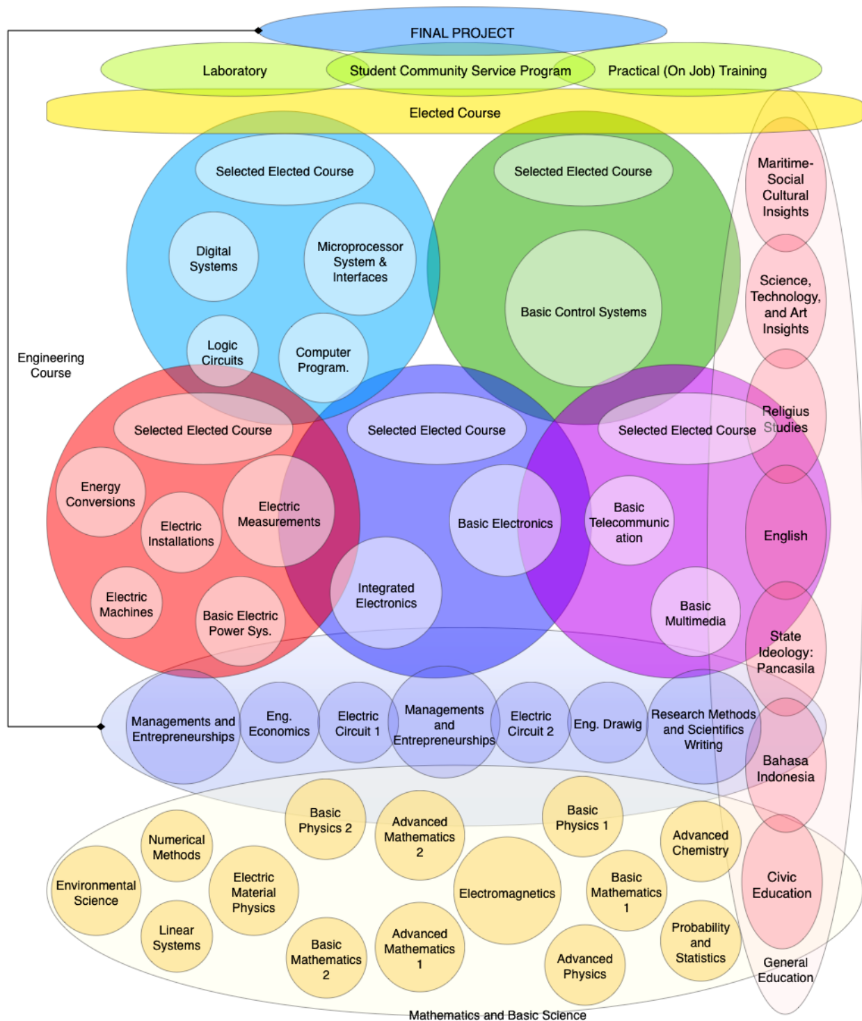
Figure 5-2 Flowchart or worksheet that illustrates the prerequisite structure of the program.